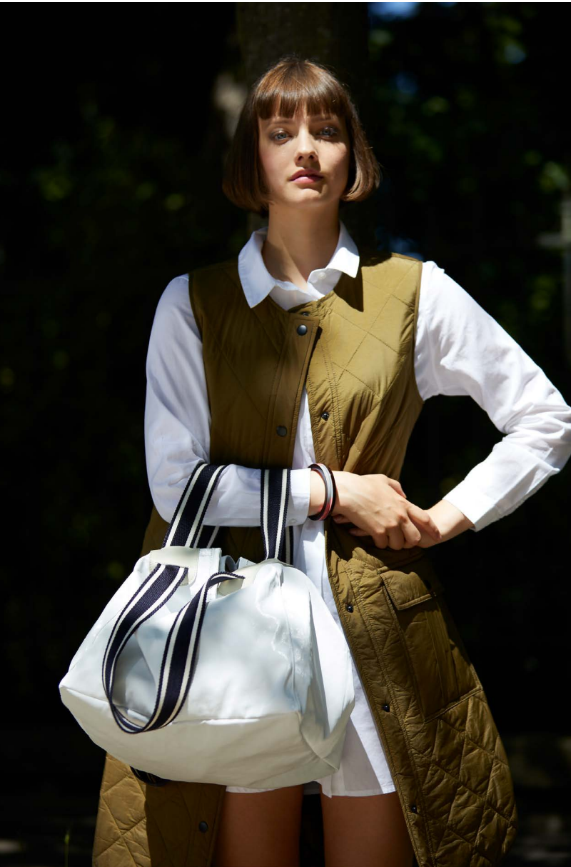
ATELIER Transat Tote bag