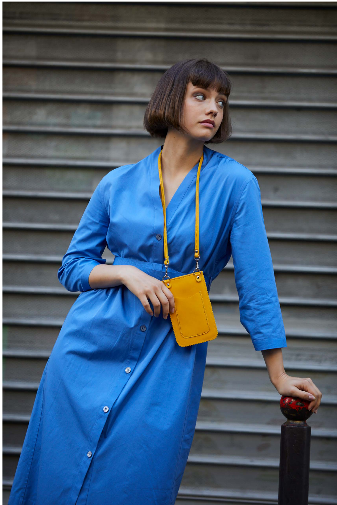
ATELIER Niki Phone holder ATELIER Elle Shoulder bag