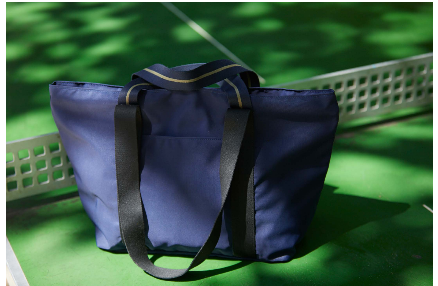
ESCAPE Upcycled Ocean Floor Riga Shoulder bag ESCAPE Upcycled Ocean Floor Sydney Travel bag