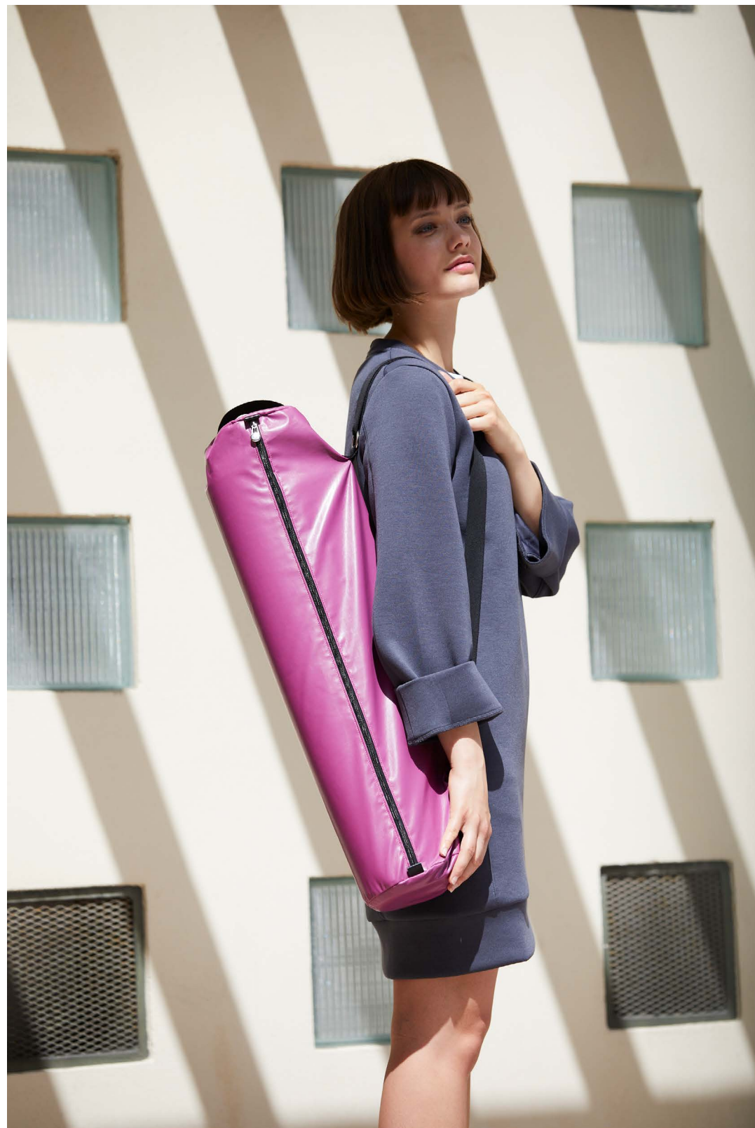
LIGHT VEGAN Bloom Bumbad LIGHT VEGAN Yoga Yoga bag