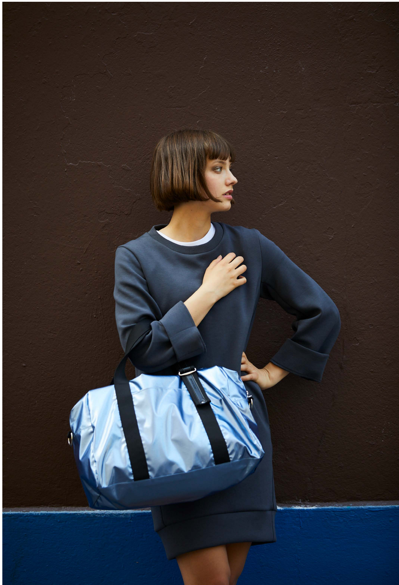
LIGHT VEGAN Walli Weekender LIGHT VEGAN Joy Shoulder bag