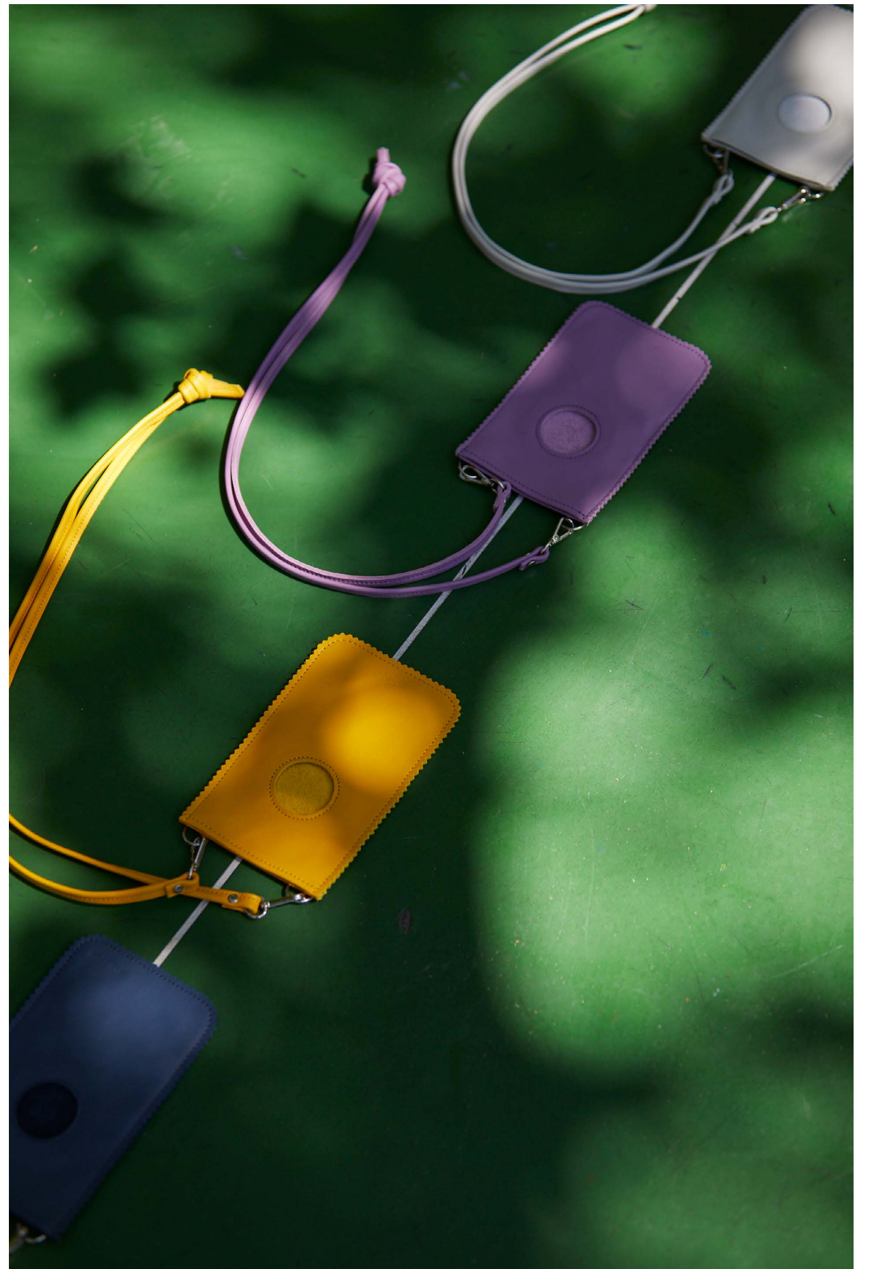
ATELIER Libre Tote bag ATELIER Niki Phone holder