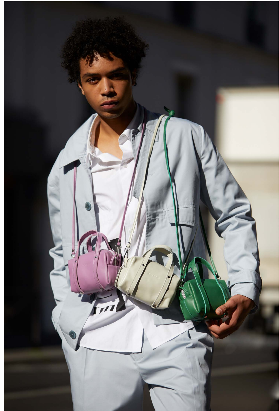
ATELIER Yvon Shoulder bag ATELIER Miguel Shoes